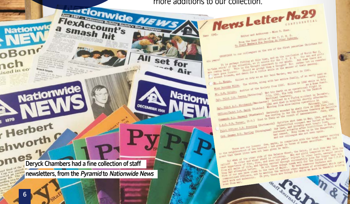
Deryck Chambers had a fine collection of staff newsletters, from the Pyramid to Nationwide News

We still have a few gaps to fill so if you have any employee magazines from 1989 to 2001 or 2009 to 2015, we'd be extremely grateful for more additions to our collection.